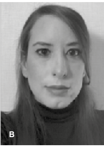
Pic. 3. A – before treatment. B – 3 months after treatments.

Melanocytic lesions are a group of conditions that produce adnexal hyperpigmentation and the eyeball due to an increase in the number of melanocytes. These include the nevus of Ota (oculodermal melanocytosis). In the differential diagnosis, pigmentovascular phakomatosis, acquired bilateral nevus of Ota and nevus of Ito must be ruled out. It can also cause confusion with xeroderma pigmentosum, basal cell carcinoma and / or malignant melanoma [4].