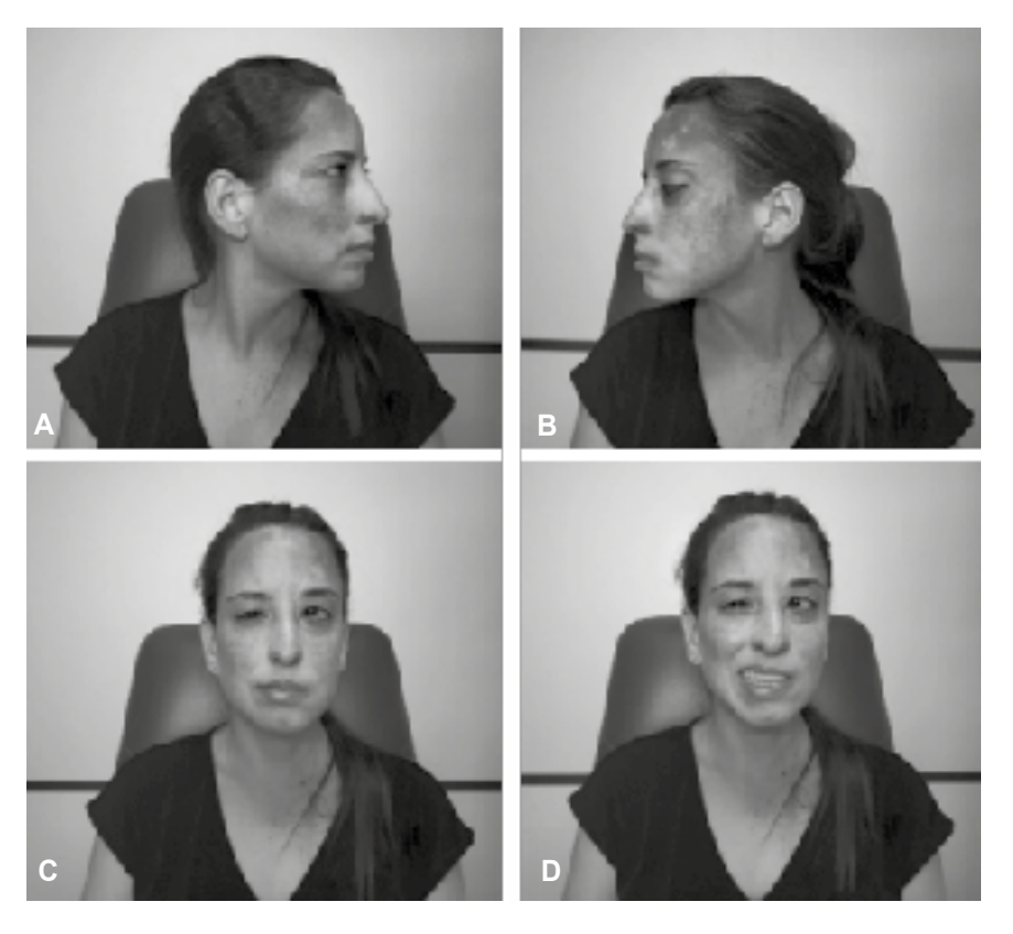
Pic. 1. Patient before treatment.A – nevus of Ota on right side of the