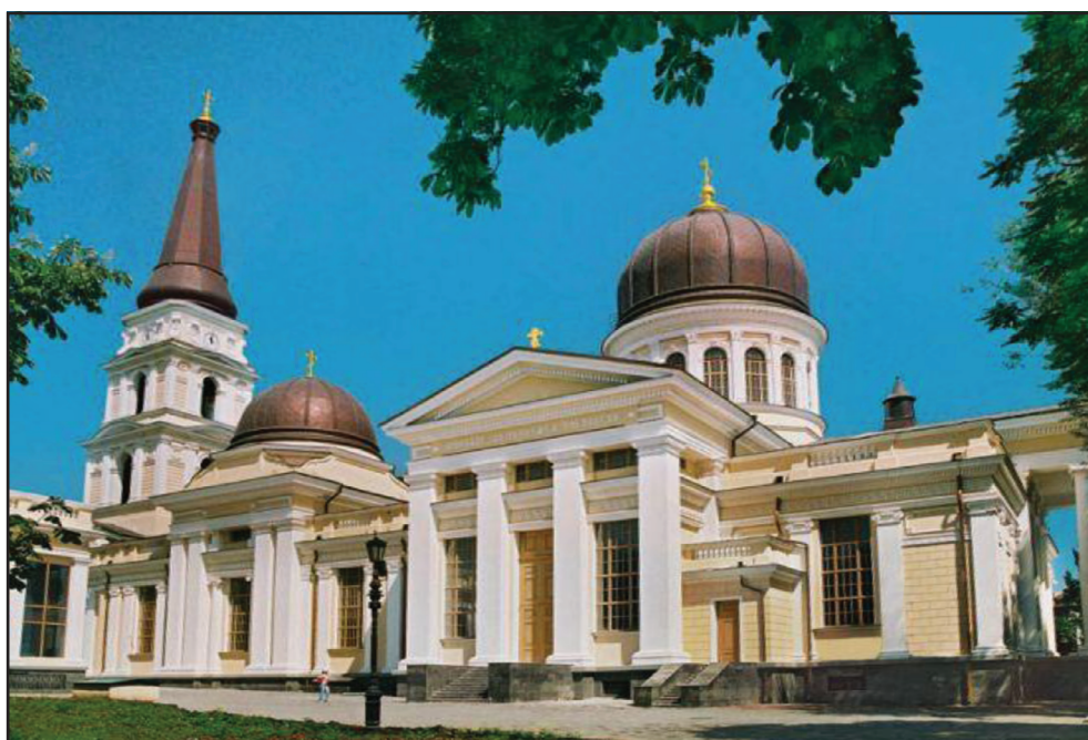
Fig. 3. The reconstructed Transfiguration Cathedral nowadays.