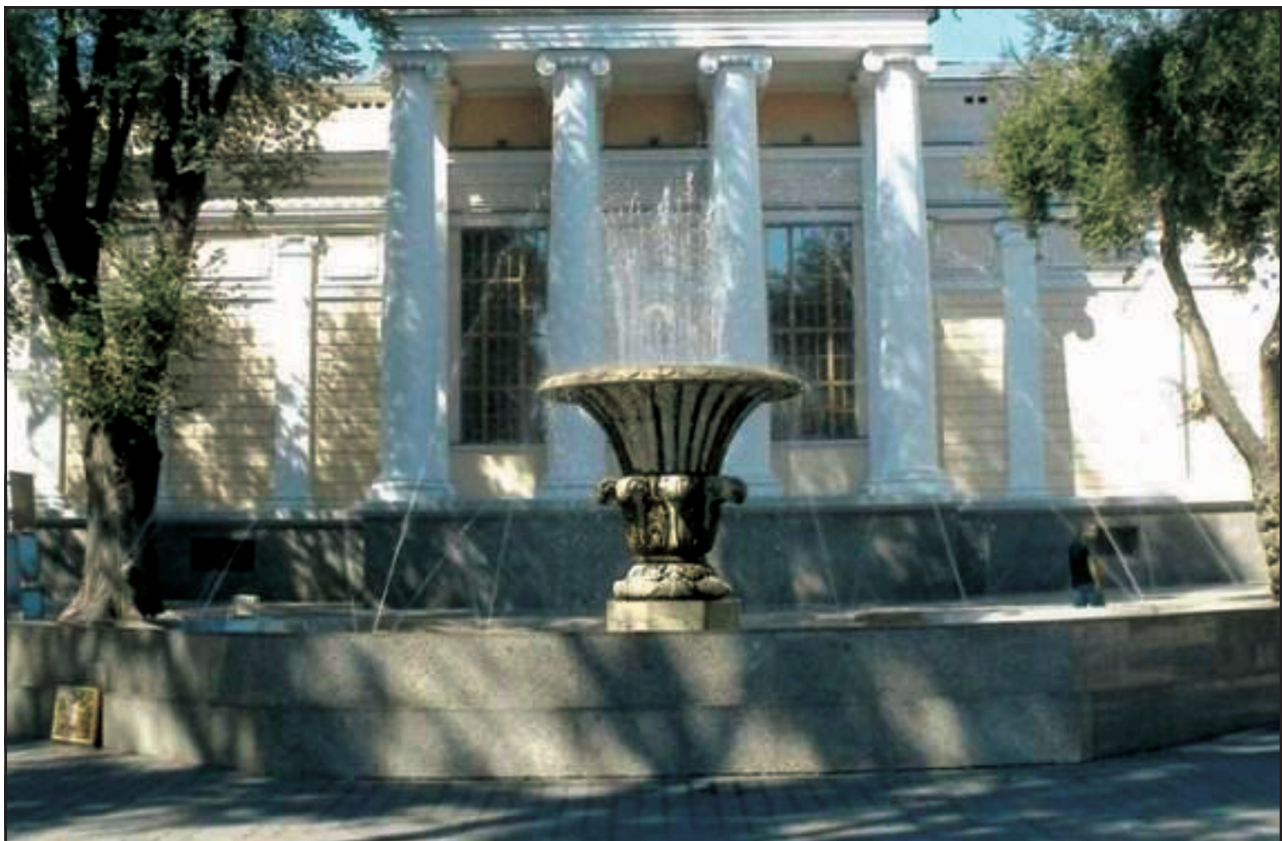
Fig. 6. Filatov's fountain on the Sobornaia square.