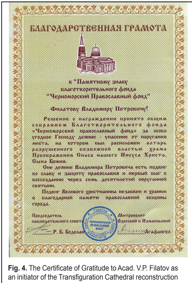
Fig. 4. The Certificate of Gratitude to Acad. V.P. Filatov as an initiator of the Transfiguration Cathedral reconstruction