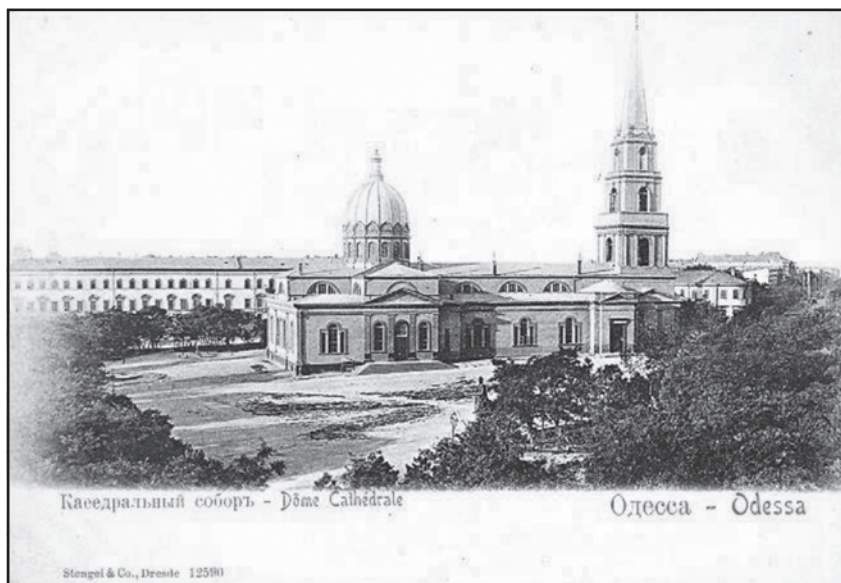
Fig. 1. A postcard with a view of the Cathedral in the XIX century

In 1999, the Ukraine's Cabinet of Ministers included the Church in "The Program for Reconstruction of the Outstanding and Lost Monuments of the Ukraine's History and Culture". The Transfiguration Cathedral was reconstructed what is called all together. A charitable organization, the Black-Sea Orthodox Foundation, was established; many Odessa's enterprises, Eparchy of Odessa, the mayor and citizens of Odessa. Clergymen, architects, historians, builders, businessmen – they all united for revival of the lost Sanctuary [13]. And as early as 6 years later, the Transfiguration Cathedral, raised from