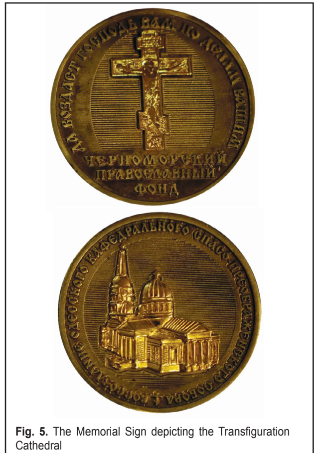
Fig. 5. The Memorial Sign depicting the Transfiguration Cathedral